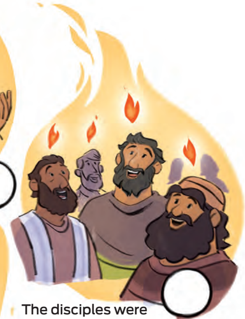
The disciples were filled with the Holy Spirit.