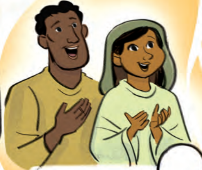
Everyone who believed Peter's message was baptized.