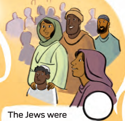
The Jews were amazed to hear the disciples speaking in their own languages.